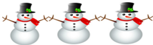
Amos Benjamin Charlie

Once upon a time there were three(3) snowmen, Amos, Benjamin and Charlie. Using a forklift they were put, two at a time, onto a platform to be weighed. We know the following facts. The combined weight of Amos and Benjamin is 163 pounds. The combined weight of Amos and Charlie is 145 pounds. The combined weight of Benjamin and Charlie is 152 pounds. What are the individual weights of Amos, Benjamin and Charlie?