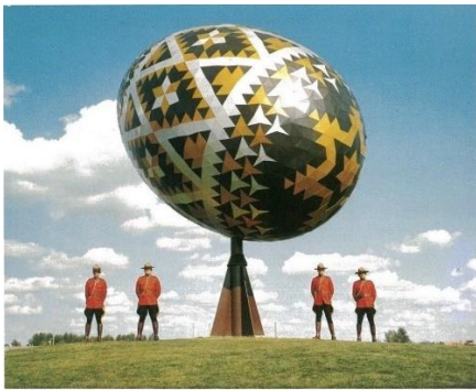
WORLD'S LARGEST PYSANKA, VEGREVILLE, ALBERTA, CANADA