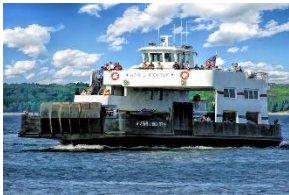
Arni J. Richter Car Ferry

GET ON THE BOAT! It's time to leave the island.