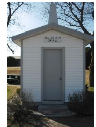
U. S. CENTER CHAPEL – inside and outside